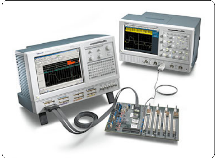
▶ TLA5000 Series with TDS5000 Series Oscilloscope.

Number of TDS Oscilloscopes that Can Be Connected to a TLA System – 1.