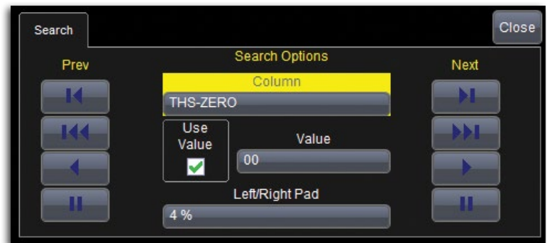
Quickly and easily search for a signal type of interest. Choose from 28 criteria to quickly pinpoint an area of interest, zoom in, and analyze. Use previous and next controls to find the next instance for quick and easy debug.

Search through a long record of decoded data by entering any of 28 available search criteria by entering a value or simply finding the next occurrence.